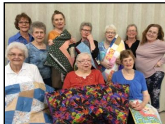
UMC Quilt & Craft Group