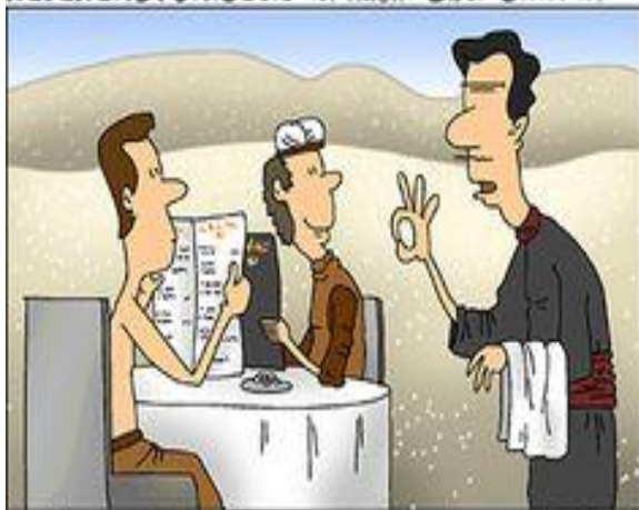
(See Numbers 14) 09-26-2014

OUR SPECIALS OF THE DAY INCLUDE MANNA IN A SMOOTH MANNA REDUCTION AS WELL AS TODAY'S FRESHLY COLLECTED MANNA SALAD TOPPED WITH THREE DIFFERENT SIZES OF MANNA AND, FOR DESSERT ... MANNA